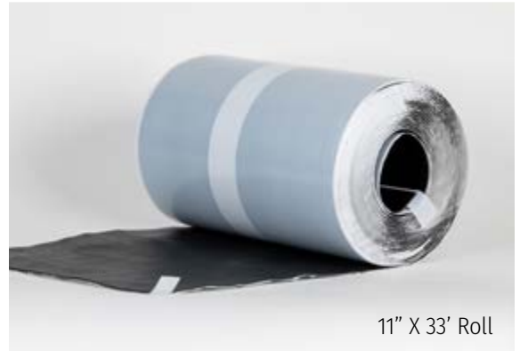
11" X 33' Roll

When it comes to your roofing system, protecting your investment goes beyond choosing the right roof covering. As one of the thickest and most durable flexible flashing in the industry, this component comes backed with a 30-year warranty to bring you peace of mind for years to come. That's what sets us apart.