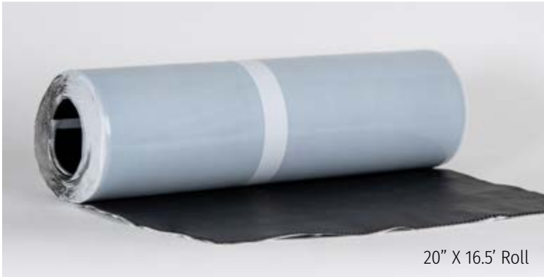
20" X 16.5' Roll

Secure Roll is a flexible flashing used to make transition areas of a roof watertight. Easy to install and available in two different sizes, Secure Roll features a double release, fully-adhered back that enables you to flash all of the significant areas of the roofscape prior to, during and after installation.